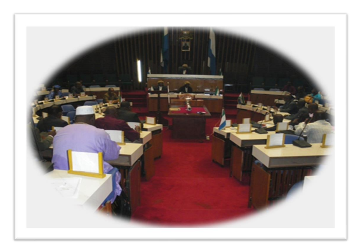
THE CHAMBER OF PARLIAMENT OF THE REPUBLIC OF SIERRA LEONE